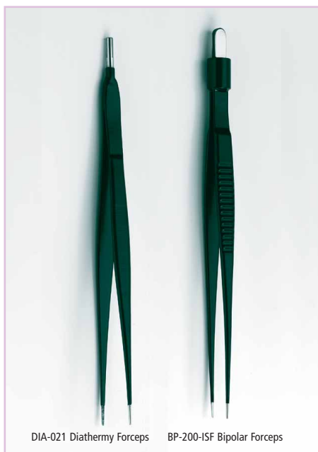
DIA-021 Diathermy Forceps BP-200-ISF Bipolar Forceps

We supply re-usable Bipolar and Diathermy forceps for all specialities. We also supply leads for both types of forceps. Contact us at the number below for a full colour brochure